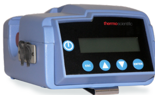
Thermo Scientific™ Personal DataRAM pDR-1500 Monitor

delivered through volumetric flow control and ACGIH traceable cyclones, available in pairs, for PM10 and PM4 or PM2.5 and PM1. A toroidal entrance assures optimized aerosol aspiration and a representative sample even without a cyclone.