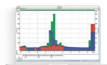
SF 100A_3OCT License of 1/3 octave